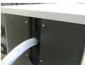
Pipe and cable are going through a polypropylene brush