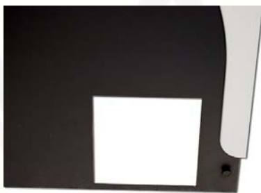
Lateral window for easy oil level check