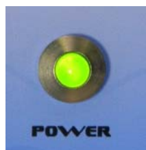
Easy visual check for operation