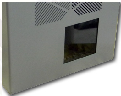
Window for easy oil level check