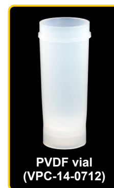
PVDF vial (VPC-14-0712)

VPC-14-0309-C Pre-cleaned PFA cap for V-14 vial. Qty 100