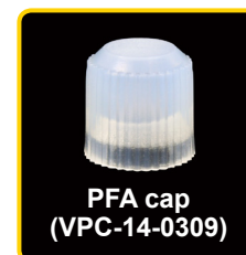
PFA cap (VPC-14-0309)