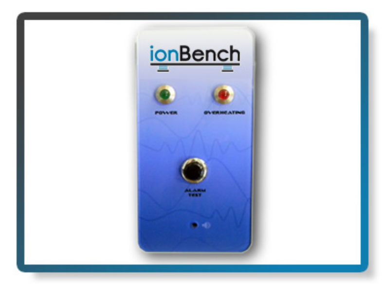
Overheating temperature alarm