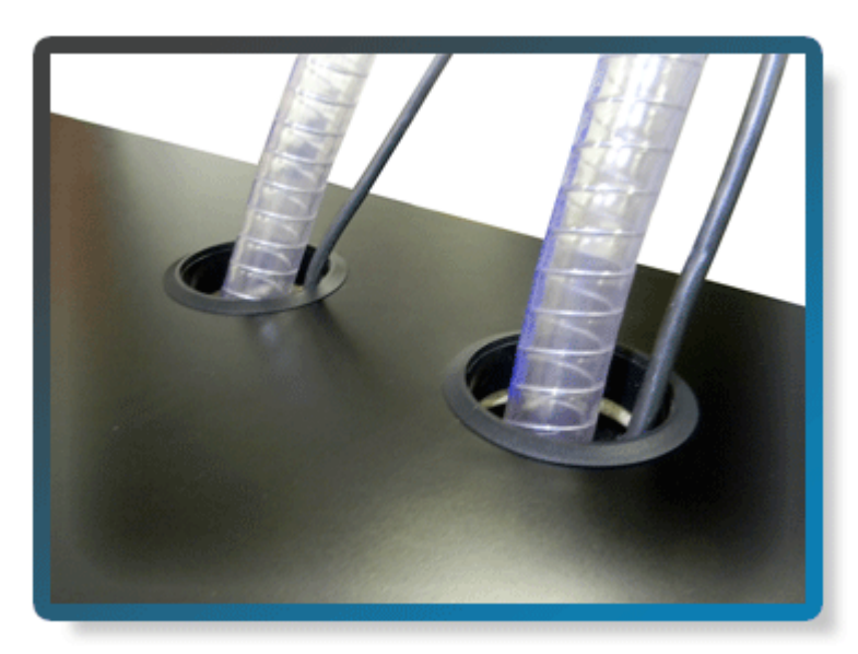
Pipe and cable management