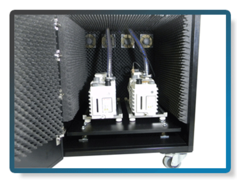
Noise enclosure for vacuum pumps