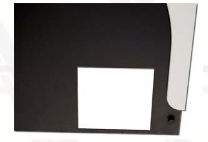
Lateral window for easy oil level check