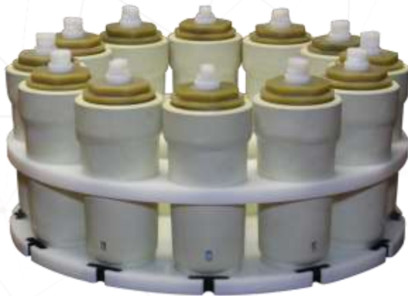
eVHP Vessel Set