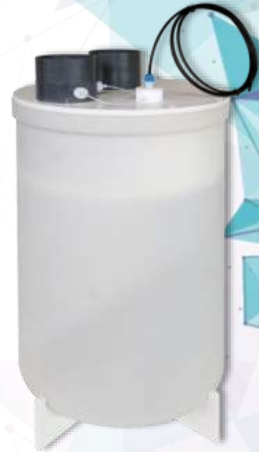
Laboratory Grade Scrubber (18.5 " diameter X 34 " high)

Even if you have a roof-top scrubber, the acid fumes are better handled at the point of source, before they corrode and otherwise damage the conduits and other hardware to the roof-top. Questron's uniquely designed fume Scrubber was developed with our Vulcan product in mind, but it would find application at any place where concentrated and hot fumes are generated, such as in fume hoods. More than 90% efficiency is achieved for most exhaust constituents, such as HNO 3 and HF acids. The unit requires a source of clean water at 1 liter per minute. Package includes an acid resistant exhaust blower that provides exhaust flow through the scrubber at 1000 to 1400 ft per minute.