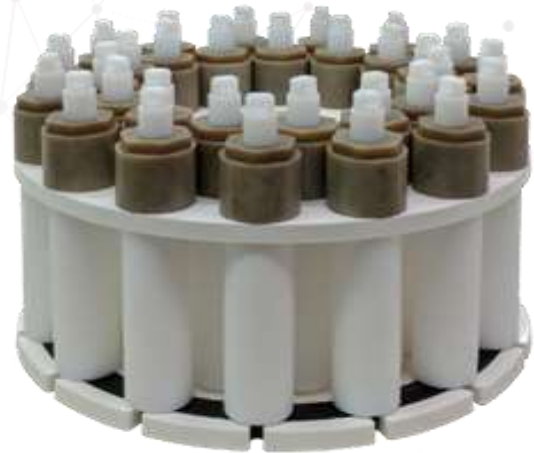
LVHT Vessel Set